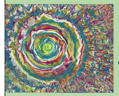
The Miracle of the Sun happened on 13 October 1917 at Fatima when Our Lady appeared to three young shepherd children. It was witnessed by over 30,000 people!

Create Miracle of the Sun spinners. Visit Catholiclcing.com: <u>http://bit.ly/1FJRwzR</u>