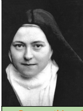
Spend a day doing little things for God and others in honour of St Therese of the Child Jesus "The Little Flower" (Thursday 1 October).

Do something nice for animals to celebrate St Francis of Assisi (Sunday 4 October), such as feeding the birds.